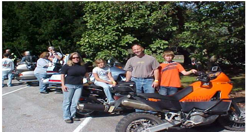
The Trought Family