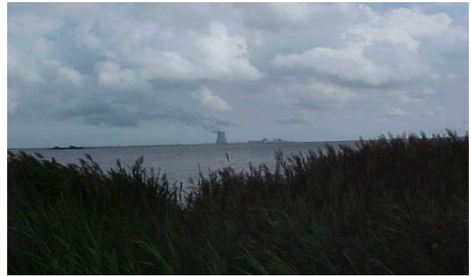
Oyster Creek Nuclear plant across the Delaware River