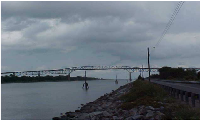
This is the Reedy Point Bridge we rode over.