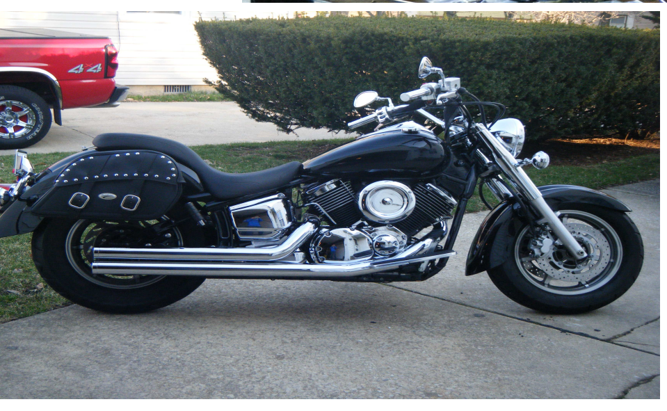
Elaine's New Ride SHARP!!!!!