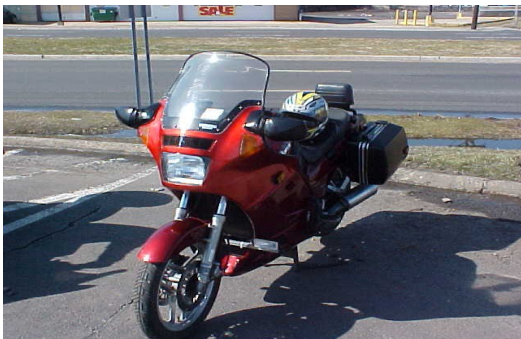
Jim's New Ride